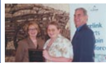
Judi Moylan officially opened the Boddington Centrelink Agency in April this year.