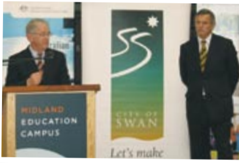
The Minister for Vocational and Further Education, the Hon Andrew Robb AO MP announces the new Australian Technical College as Stuart Henry, the Member for Hasluck looks on.

The new college brings the number of Australian Technical Colleges to 28.