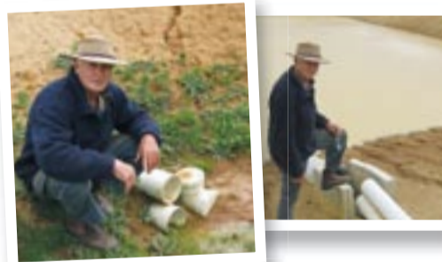
The Hardies use interceptor banks to drain excess water from waterlogged paddocks and direct it back into natural winter streams and dams.

In future, as a carbon trading scheme gets under way, these areas may well pay dividends