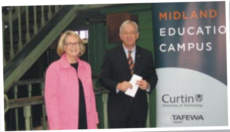
Member for Pearce, the Hon Judi Moylan MP with the Minister for Vocational and Further Education, the Hon Andrew Robb AO MP.

The north-east metropolitan area is to be home to Australia's newest Technical College.