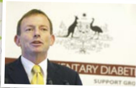
Federal Minister for Health and Ageing, the Hon Tony Abbott MP was a special guest at the Diabetes Futures Forum.