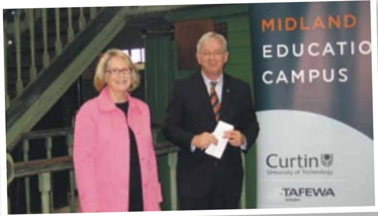
Member for Pearce, the Hon Judi Moylan MP with the Minister for Vocational and Further Education, the Hon Andrew Robb AO MP.

The north-east metropolitan area is to be home to Australia's newest Technical College.