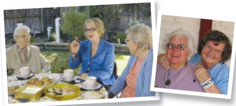
Many seniors and carers living in Pearce are celebrating after receiving a bonus from the Australian Government. Eligible people received payments of $500 or $1,000.

It was Christmas in July for over 17,000 seniors and carers living within the Pearce Electorate who recently received a bonus from the Australian Government.