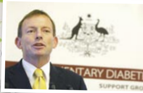
Federal Minister for Health and Ageing, the Hon Tony Abbott MP was a special guest at the Diabetes Futures Forum.